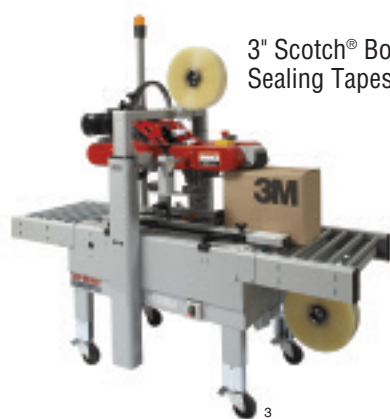
3" Scotch® Box Sealing Tapes