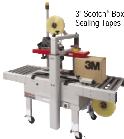
3" Scotch® Box Sealing Tapes