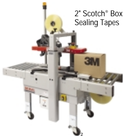
2" Scotch® Box Sealing Tapes